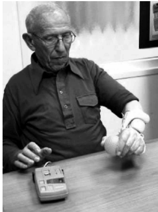
Fig. 3. Activity during functional stimulation mode.

Individual joints with normal or flaccid muscle tone (Ashworth: 0) were not included in the analysis, as no measurable spasticity