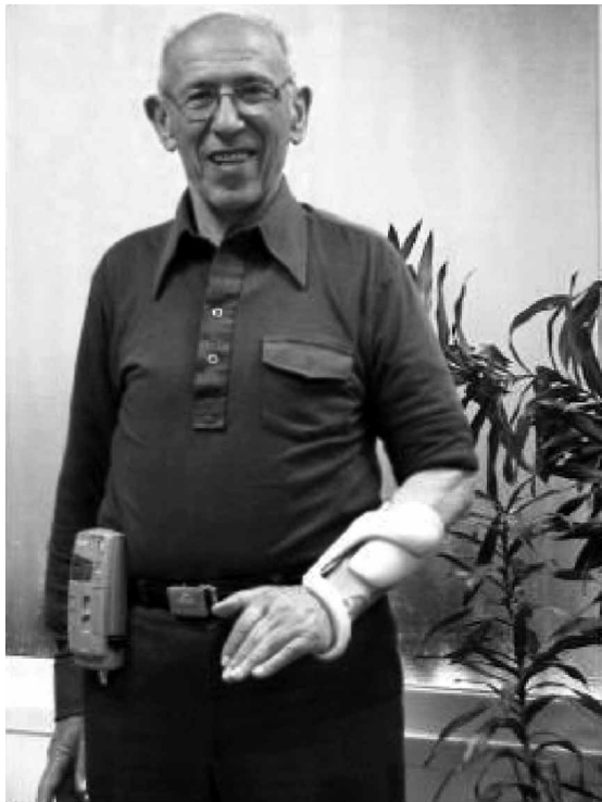
Fig. 2. Therapeutic stimulation mode.

Handmaster ™ upper limb system following completion of the initial assessment. The single fitting session included instruction of the patient and a family member or attendant in use of the system. The patients were provided with a protocol for home use. The protocol was developed in prior pilot studies, and stimulation parameters were individually adjusted as to pulse duration and amplitude based on muscle response to achieve a full arc of finger motion, and patient tolerance. System use started at 10 minutes twice a day, progressed up to 50 minutes 3 times a day over the first 2 weeks, and remained at this level of use until the end of the 6-week study. Patients used 2 therapeutic stimulation modes: intermittent finger extension (Fig. 2), and alternating finger flexion and extension. The type II patients used the functional modes for various assigned activities (Fig. 3). Patients were encouraged to attempt to actively carry out the movements during the stimulation.