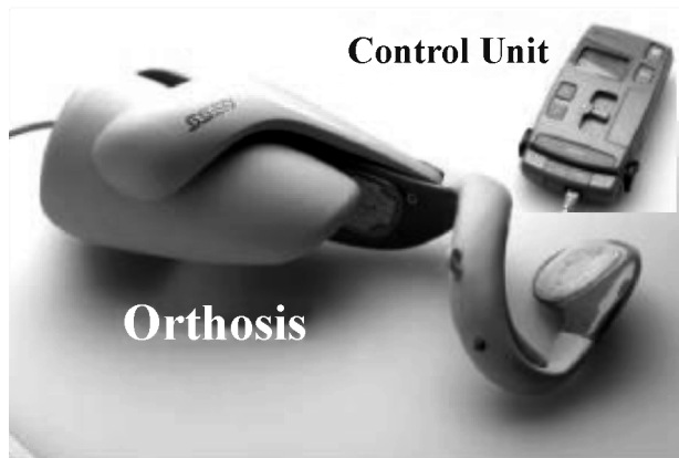
Fig. 1. NESS Handmaster ® .

The device consists of a wrist-hand orthosis (WHO) with an incorporated portable, non-invasive microprocessor controlled stimulation system